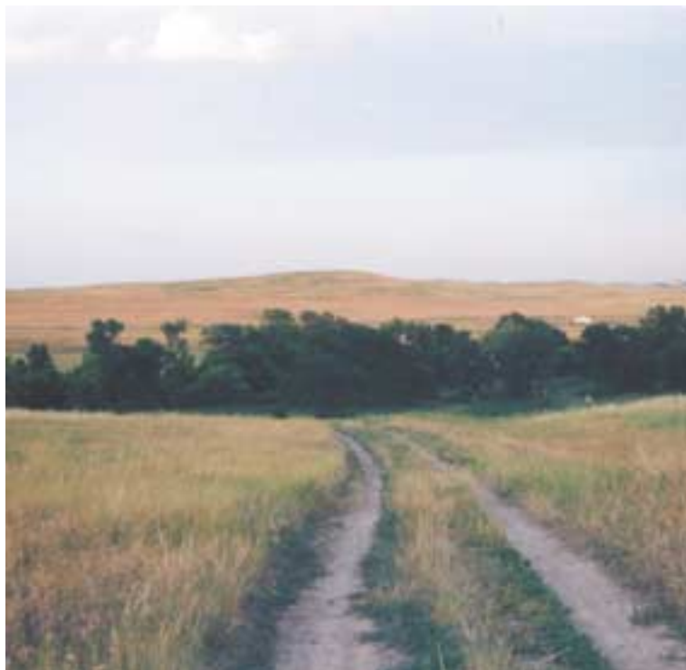
This photo shows a portion of the 160 acres of land outside Manderson where the Lakota Project Educational Center will be built for the children.

Can you purchase 160 acres for a mere $16,000? Well, we can! And we will! The Lakota Project has made the financial commitment to purchase 160 acres outside of Manderson, South Dakota on the Pine Ridge Reservation. This parcel of land will serve as Community Cultural Education Center and headquarters for the Lakota Project. The three Lakota Grandmothers who currently own the land have graciously supported the Lakota Project by selling this parcel at a substantial discount. They are pleased the land will be used in such an honoring way. Please help us in making the final purchase of the land by donating today or making a fundraising commitment to assist in the purchase. We challenge you to kick off a Sponsor-an-Acre campaign, where each acre may be purchased for a mere $100! Or host a fundraiser to install a well... or gravel a drive... or purchase lumber... or... let your imagination flow!